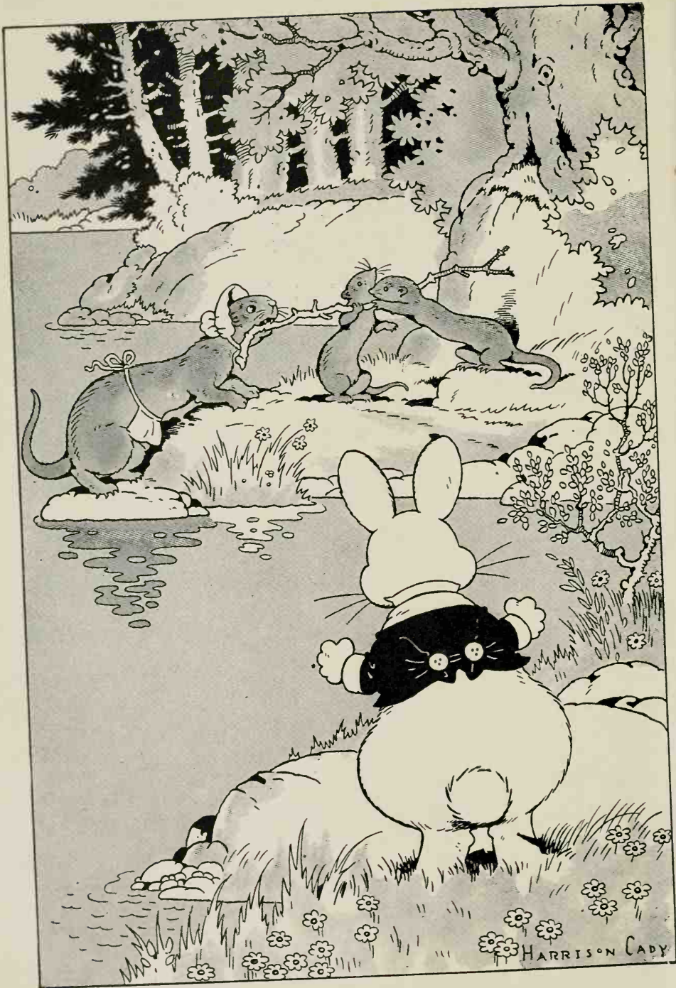
ONE MORNING HE SAW MRS. JOE OUT WITH THE TWO BABIES. Page 28.